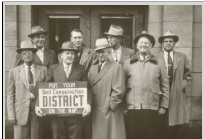
Conservation Districts were formed in response to the Dustbowl catastrophe of the 1920s and 1930s.

In addition, Soil and Water Conservation Districts (SWCD) in some states, such as Iowa, have regulations requiring farm operators to limit the soil loss to certain levels. 38 However, the mechanisms for enforcement as well as the will to enforce these rules is often limited. Again, while there are, perhaps, more effective means of protecting your land, such provisions do have a place in farm lease agreements. It may be beneficial to seek out your local SWCD commissioners, inquire about soil loss limits, and learn more about enforcing such limits on your property. In Iowa, complaints regarding soil loss limits can be brought by adversely affected neighbors or local officials. 39 Landowners are not included in the language of the statute.