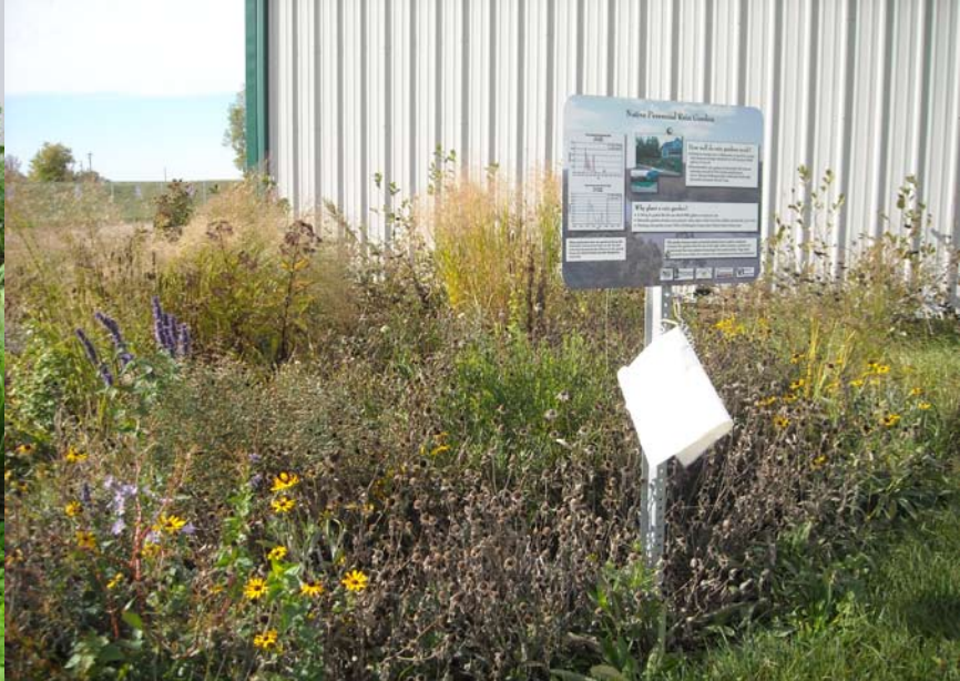
Native Raingarden planted with pots - 3 years after planting Year 4 (2009) October