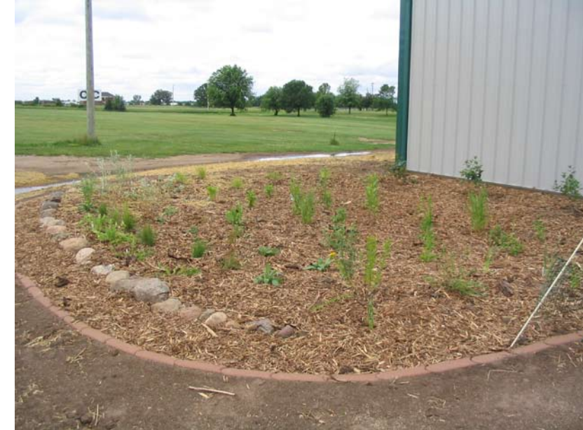
Native Raingarden planted with pots - 2 weeks after planting Year 1 (2006) June