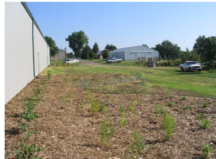
Native Raingarden planted with plugs - 2 weeks after planting Year 1 (2006) June