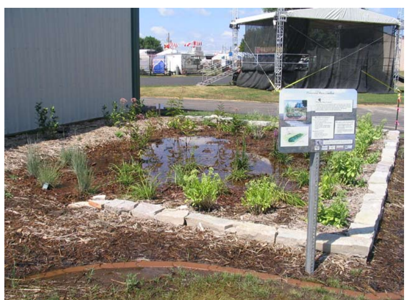
Perennial Raingarden - 2 months after planting Year 1 (2006) August