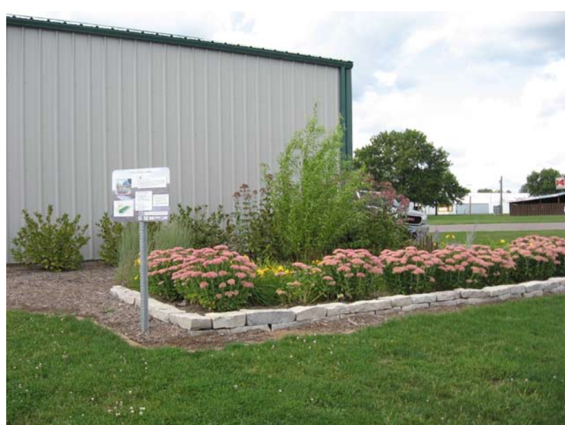
Perennial Raingarden - 2 years after planting Year 3 (2008) September