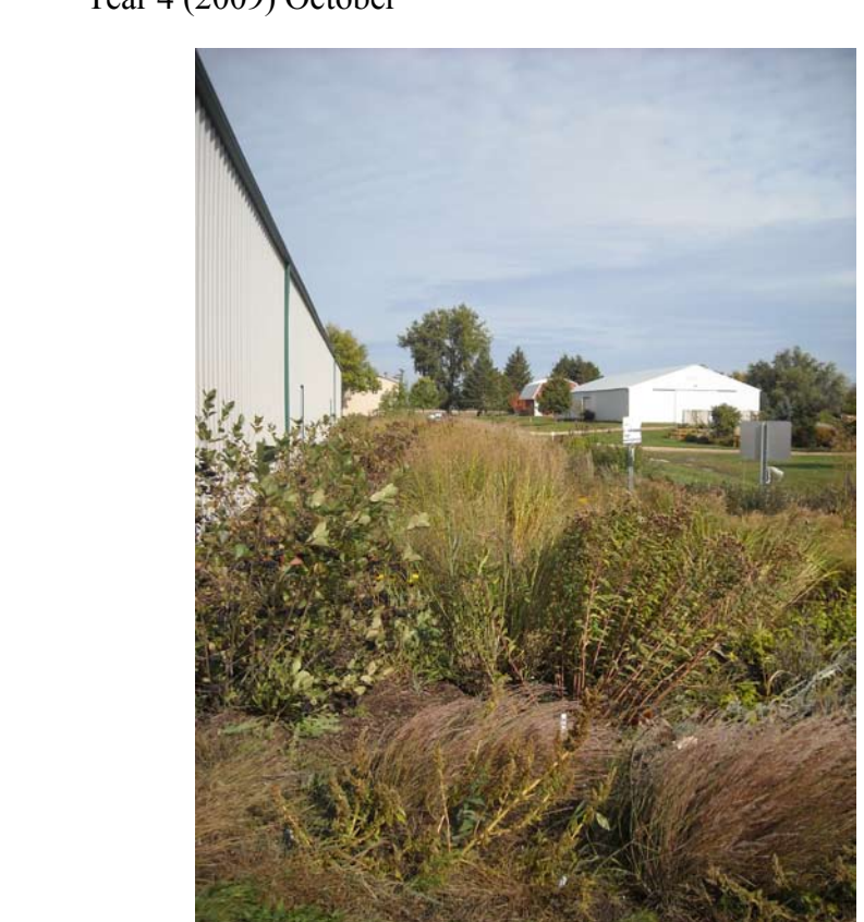
Native Raingarden planted with plugs - 3 years after planting Year 4 (2009) October