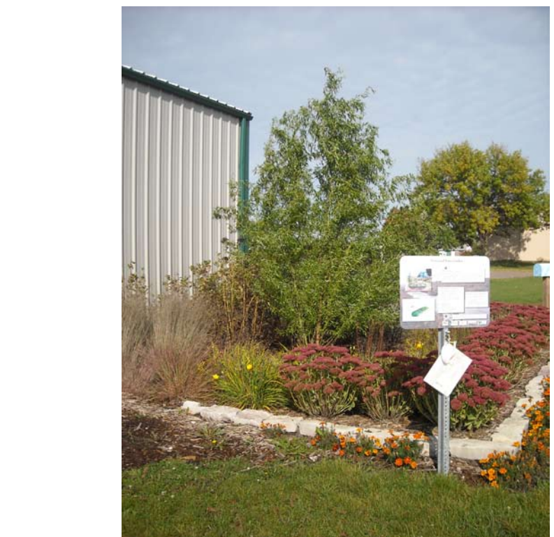
Perennial Raingarden - 3 years after planting Year 4 (2009) October