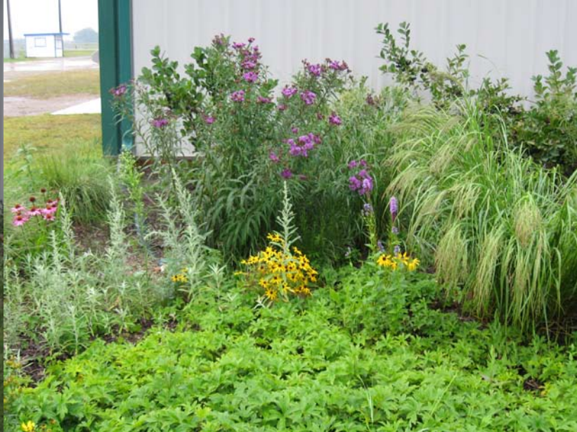
Native Raingarden planted with pots - 3 years after planting Year 4 (2009) August