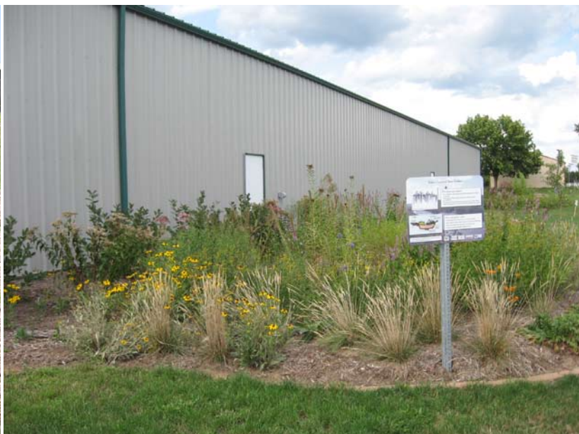
Native Raingarden planted with plugs - 2 years after planting Year 3 (2008) September