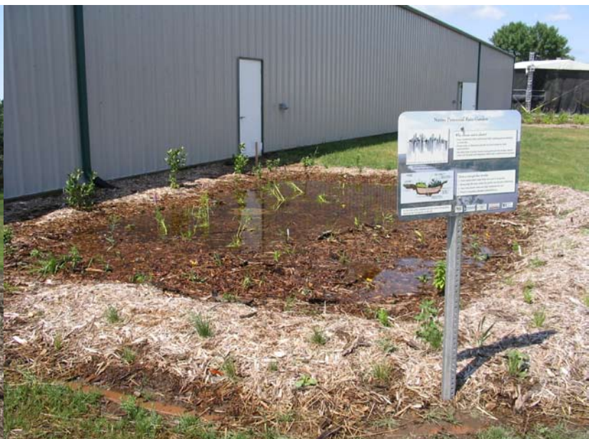
Native Raingarden planted with plugs - 2 months after planting Year 1 (2006) August