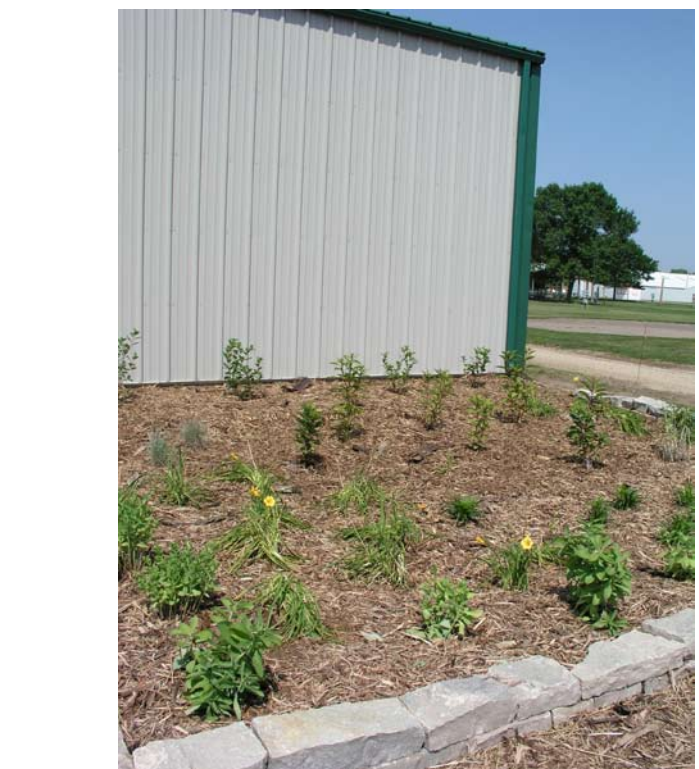
Perennial Raingarden - 2 weeks after planting Year 1 (2006) June