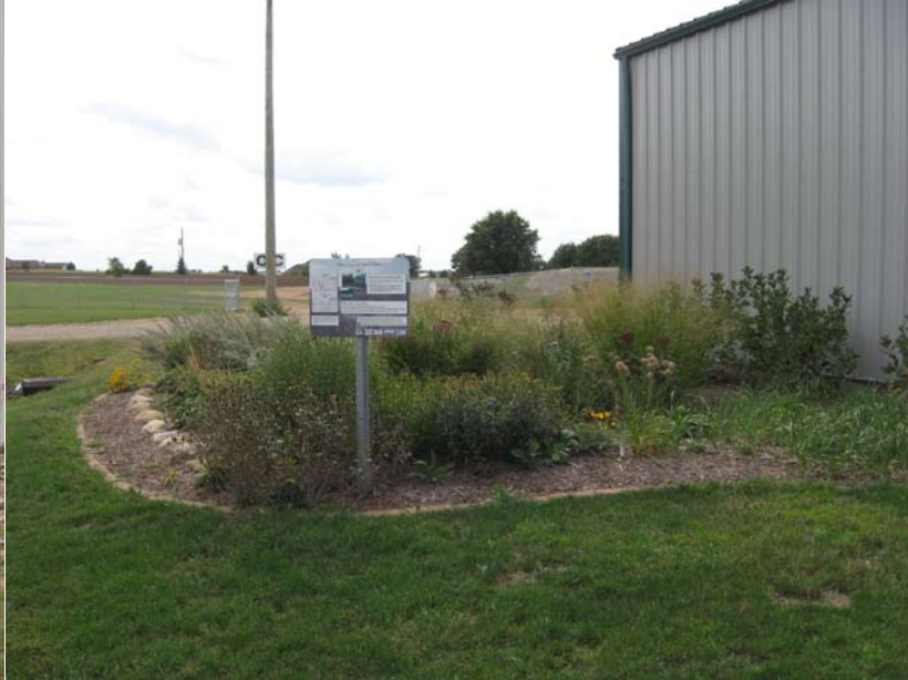
Native Raingarden planted with pots - 2 years after planting Year 3 (2008) September