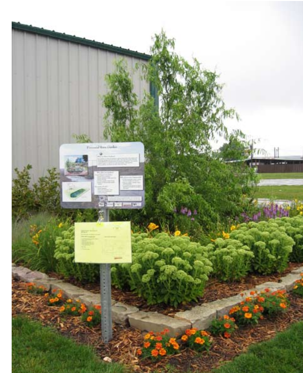
Perennial Raingarden - 3 years after planting Year 4 (2009) August