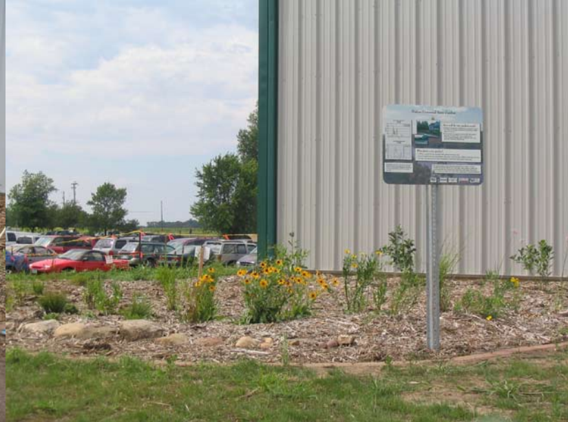
Native Raingarden planted with pots - 2 months after planting Year 1 (2006) August