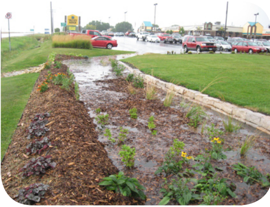
Above: The raingarden in front of Acapulco Restaurant one week after installation

Project: Three raingardens were installed to treat stormwater runoff from the parking lots at the Valley Ridge Mall in Stillwater, MN. True North Investments LLC paid for half of the cost of the raingardens, while a grant from the MN DNR covered the rest. The Middle St. Croix WMO and the Washington Conservation District designed the project.