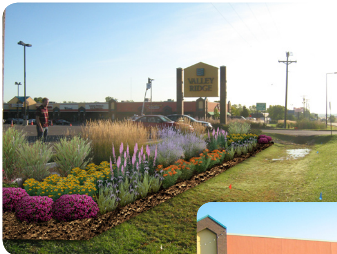
Above and left: Artist rendering of how the raingardens will look when mature