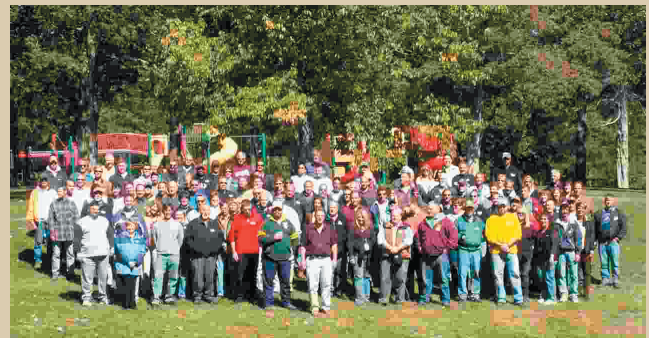
Washington County employees pose for a picture after a hike at St. Croix Bluffs Park.

For many cities and counties, training public works staff is one of the most challenging aspects of meeting the MS4 permit requirements. Beginning this fall, EMWREP will be coordinating a Public Works Forum for cities in and around Washington County. The forum, which will meet seasonally, will feature information about topics such as street sweeping, winter salting and sanding, and storm pond maintenance. We will be kicking off the series with a hands-on Raingarden Maintenance workshop at the Cottage Grove Park and Ride on Wednesday, Oct. 17. More information to come soon!