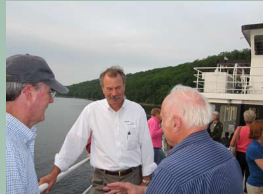
A View from the St. Croix River, workshop on the water, educated more than 100 local elected officials about water resource issues this summer.

The WCD water monitoring program is one of the largest local government monitoring programs in Minnesota. Current activities include monitoring over 40 stream, stormwater discharge, and/or water quality sampling sites, over 50 lake water quality monitoring sites, and over 100 lake gauges for monitoring lake elevation. Yearly summary reports allow partner organizations to make sound water resource decisions. Data from monitoring program are used to direct and prioritize education and BMP efforts to maximize water quality benefits.