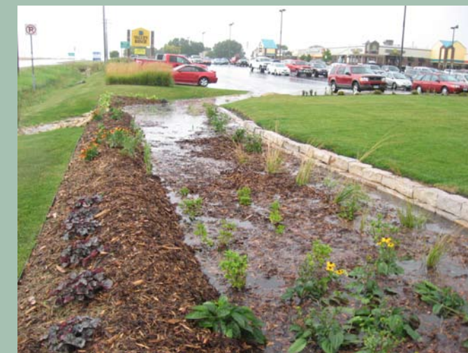
Photos: In 2009, WCD worked with public and private partners to plant three raingardens outside the WCD office at Valley Ridge Mall.