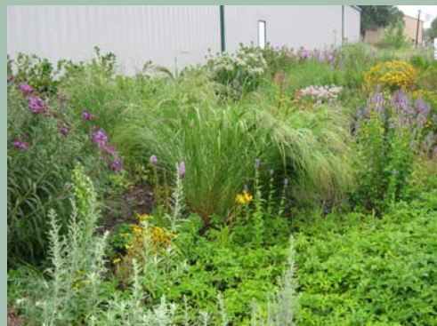
Three years after they were planted, the demonstration raingardens at the Washington County Fairgrounds are lush and lovely.